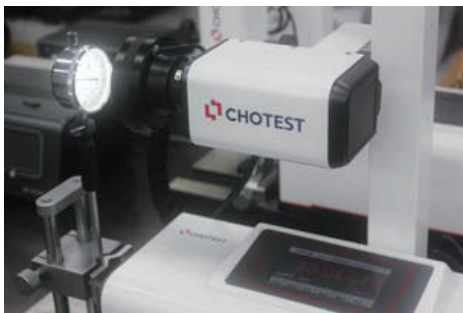
Dial bore indicator