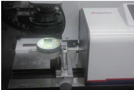
Digital dial indicator