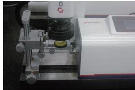
Dial test indicator