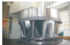
Hydroelectric Generator Assembly