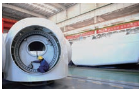
Wind-Driven Generator Assembly