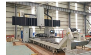
Large Machine tool Calibration