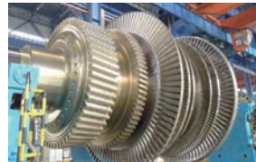
Nuclear Generator Assembly