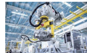
Robot Arm Calibration