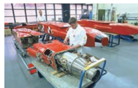
Large Weapon Assembly