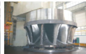
Hydroelectric Generator Assembly