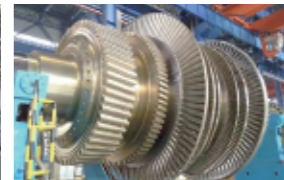
Nuclear Generator Assembly