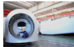
Wind-Driven Generator Assembly