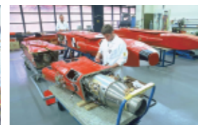
Large Weapon Assembly