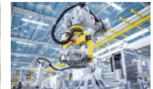
Robot Arm Calibration