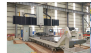
Large Machine tool Calibration