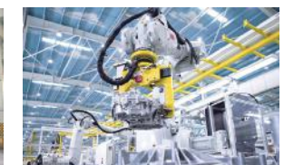
Robot Arm Calibration