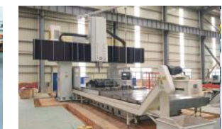
Large Machine tool Calibration