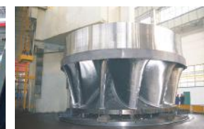
Hydroelectric Generator Assembly