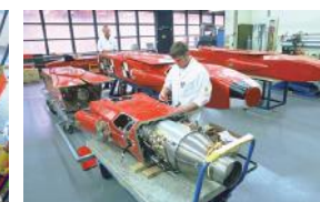
Large Weapon Assembly