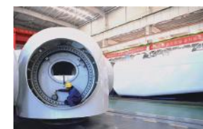
Wind-Driven Generator Assembly