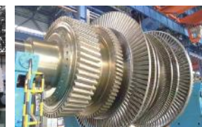
Nuclear Generator Assembly